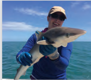
Environmental Resource Management

HSG combines technical expertise, regulatory foresight, and environmental innovation to help organizations meet their project objectives on task, on time, and on budget in today's changing regulatory environment. Our deep bench of SMEs are experienced in high-demand, high-complexity environments including critical infrastructure sectors. We translate complex technical findings into memo-ready language to support and advance investment decisions and business objectives.