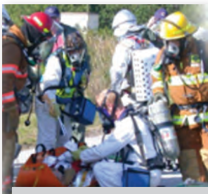
Emergency Planning & Response

HSG provides full lifecycle program design, implementation, and management—including strategic planning, staffing, and streamlining operations—for efficient, compliant, and results-driven program execution of water conservation programs, including dust suppression and arid community water savings programs.