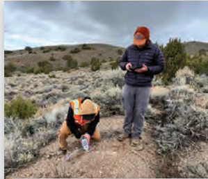
Environmental Due Diligence